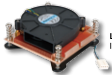
LGA1156 Cooler IEI P/N: CF-1156A-RS