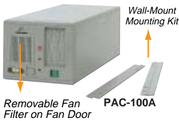
Wall-Mount Mounting Kit