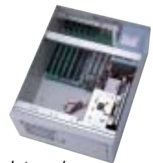
The Internal Configuration!