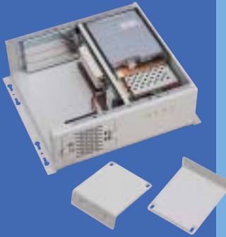
PR-1300 Top View