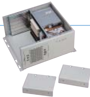
PR-1500 Top View