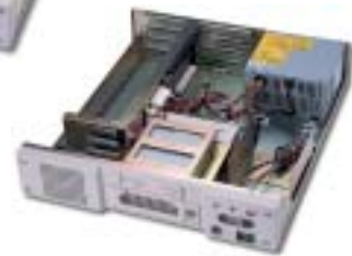
RACK-210G Top View