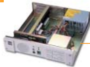
RACK-200G Top View